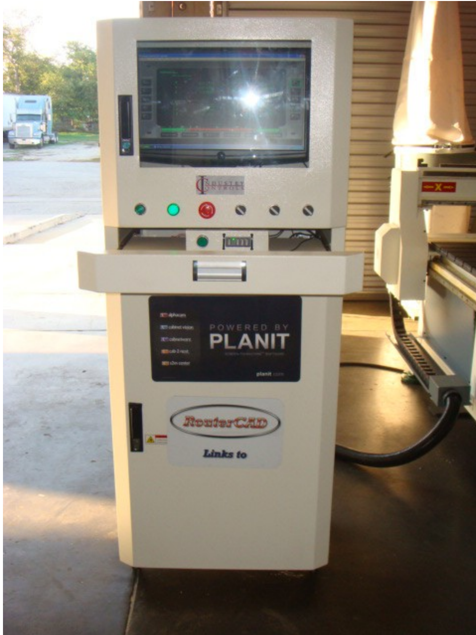
CNC Control Console