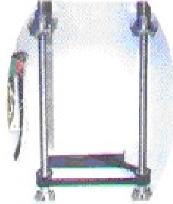
Ball Screw for Up & Down Adjustment